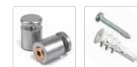
WM15 (30 ea)