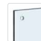
14ASP-2472/H/D6 (5 ea)